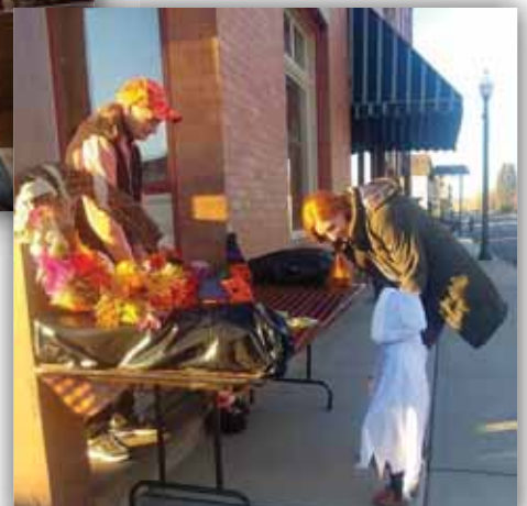
Harrington Halloween Activities