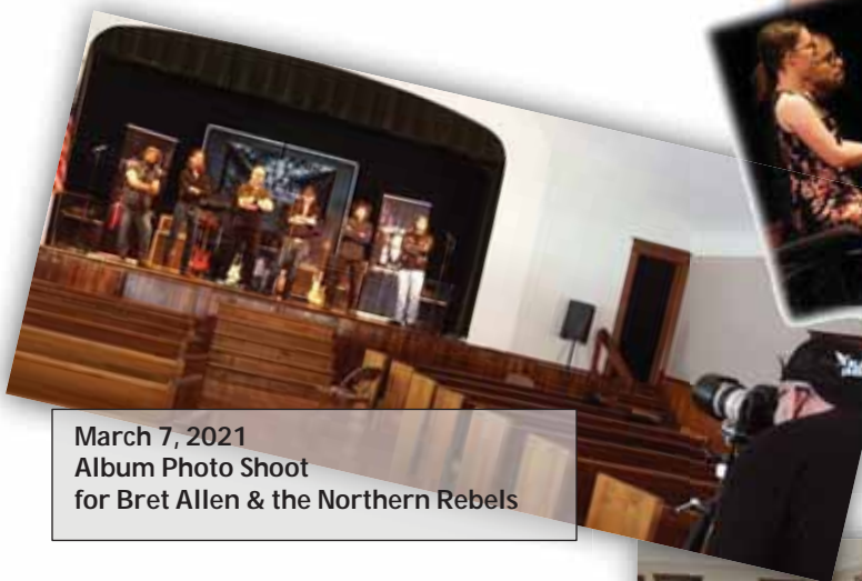
March 7, 2021 Album Photo Shoot for Bret Allen & the Northern Rebels

While the HOHS was not able to present a full schedule of public performances and presentations in 2021, the Society continued with building upkeep, fundraising, and community support.