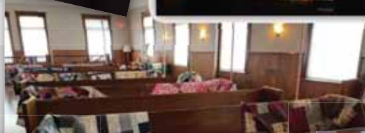
June 2021 Quilt Show Harrington Vintage Country Fair